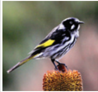
New Holland Honeyeater